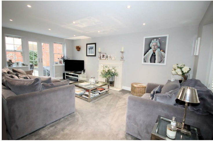
View of Living Room