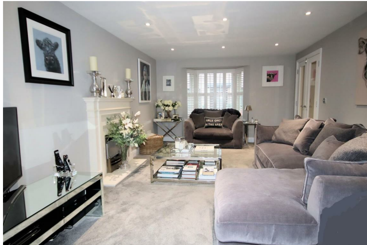
View of Living Room