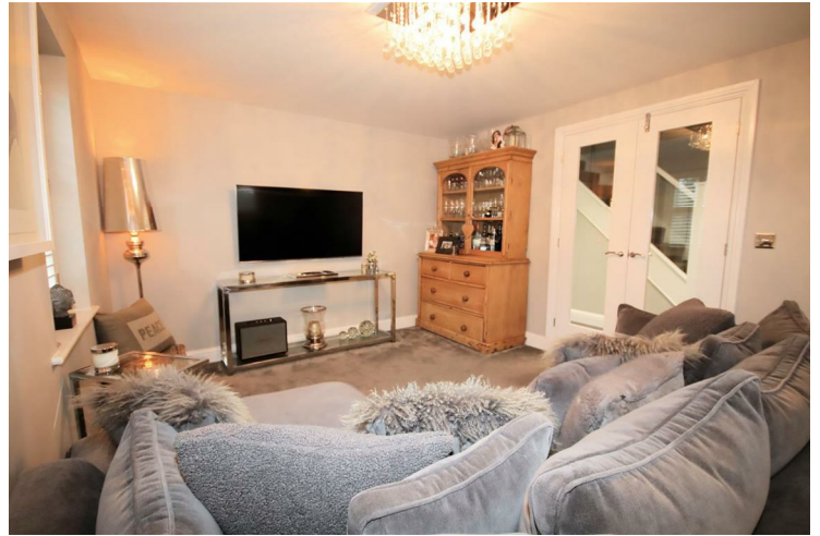
View of Sitting Room/Snug